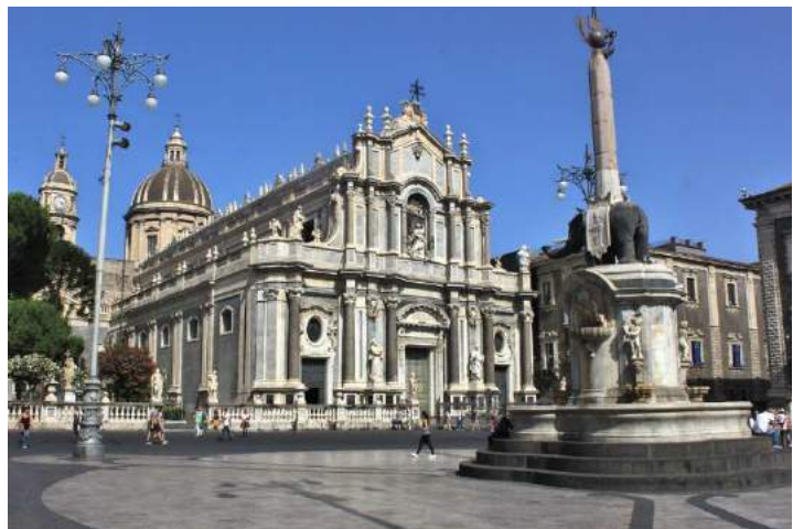
The Cathedral and “Liotru”