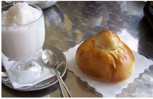
Granita with brioche