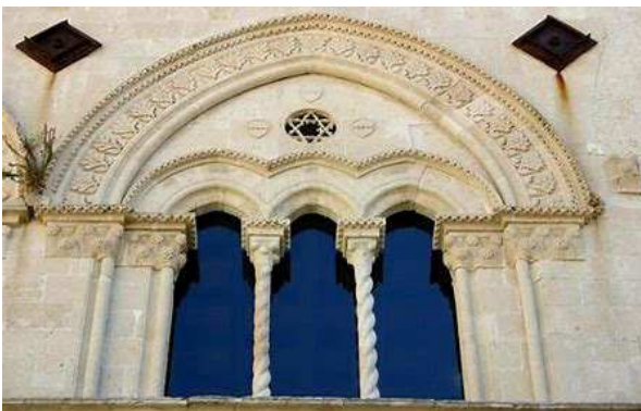
“Bagno ebraico” from the Jewish quarter

A walk through Ortigia with a visit to its colourful Jewish quarter will be something not easily forgotten, especially if you stroll around its market stalls to feel the local “vibe” and try the regional food: fish straight from the sea, fresh vegetables, fruits and herbs and street food such as the famous “Arancino” (a fried rice ball). Don’t miss Condorelli’s bar for a granita (a flavoured shaved ice drink) with a “brioche” (a sort of bun). Last but not least treat yourself to Sicily’s most famous sweet: cannoli (crispy shells filled with ricotta cheese).