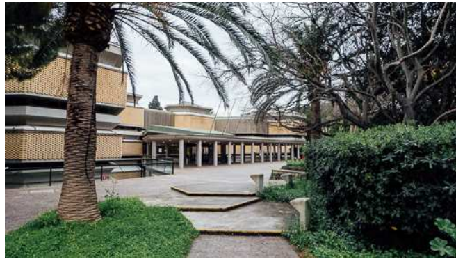
Paolo Orsi Museum