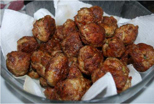
The typical horse meatballs

Between one monument and another, you may need to make a pit-stop! Why not refuel yourself with something typical found only here? The horse meatballs are perfect for adventurous foodies.