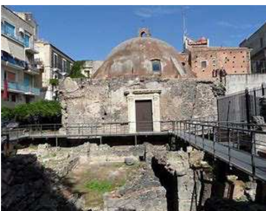
Terme della Rotonda